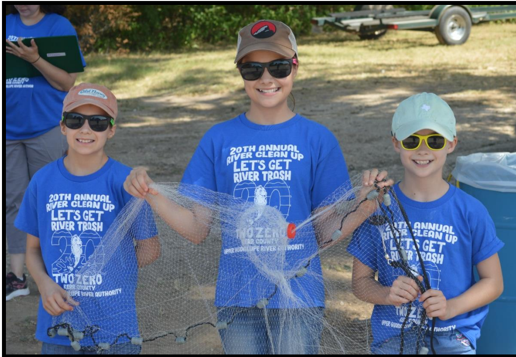
Young group of volunteers with their unusual item contest entry of a fishing cast net.