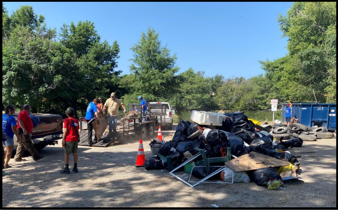
Volunteers helped unload the over 8,000 pounds of trash which included 32 tires.