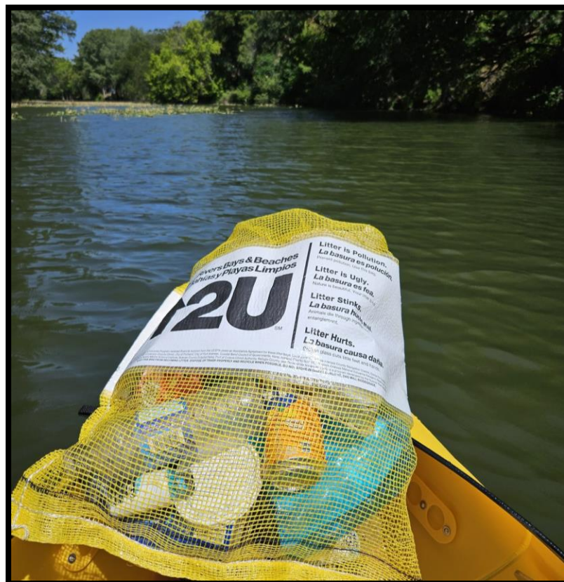
Volunteers used kayaks to collect hard to reach trash on the river.