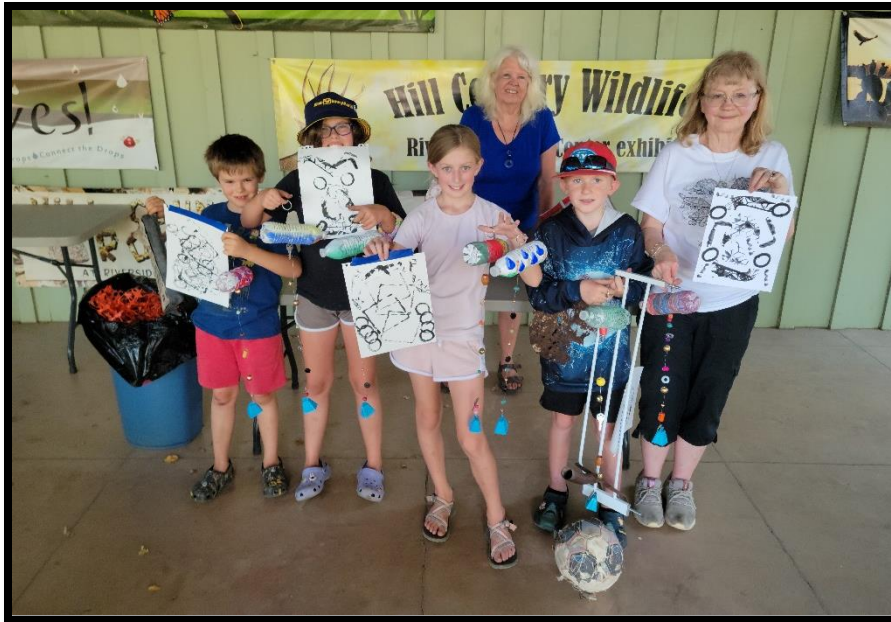
Families worked with items found during the UGRA Annual River Clean Up at the Riverside Nature Center Nature Night on August 1 st .

An additional follow-up workshop was held on Tuesday, August 1 st at Riverside Nature Center as part of their weekly summer Nature Night series. Children, parents, and grandparents worked together to use items collected during the River Clean Up to create paintings and assemblage pieces in just one hour.