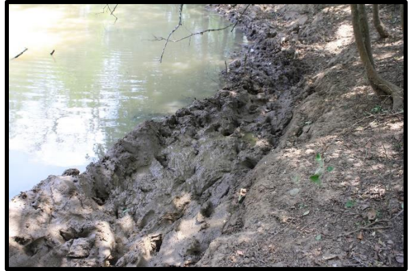
Feral hogs trample and root in riparian vegetation causing erosion and poor water quality.

Since 2017, UGRA and Kerr County have proactively partnered to offer competitive bounties for feral hogs in order to encourage reduction in the feral hog population. This program has proven to be successful in that 1,071 hogs were submitted for bounties the first year of the partnership and the number jumped to 2,262 during the next 12 months.